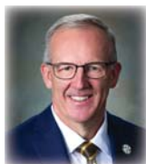
GREG SANKEY Commissioner